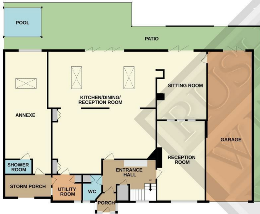
GROUND FLOOR 2419 sq.ft. (224.7 sq.m.) approx.