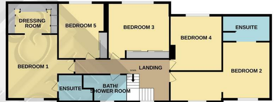
TOTAL FLOOR AREA : 3771 sq.ft. (350.4 sq.m.) approx.

Whilst every attempt has been made to ensure the accuracy of the floorplan contained here, measurements of doors, windows, rooms and any other items are approximate and no responsibility is taken for any error, omission or mis-statement. This plan is for illustrative purposes only and should be used as such by any prospective purchaser. The services, systems and appliances shown have not been tested and no guarantee as to their operability or efficiency can be given. Made with Metropix ©2023